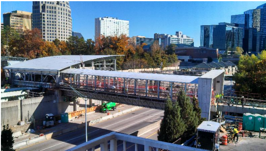
MARTA Buckhead Pedestrian Bridge in November 2013 pictured here. GA 400 lane closures planned to accommodate bridge deck patching and sign installation.

From Monday, January 27-Saturday, February 1, the Georgia Department of Transportation will close southbound lanes of GA 400 between Mile Markers 2 and 3 to remove overhang decking, patch the bridge deck and install signage.