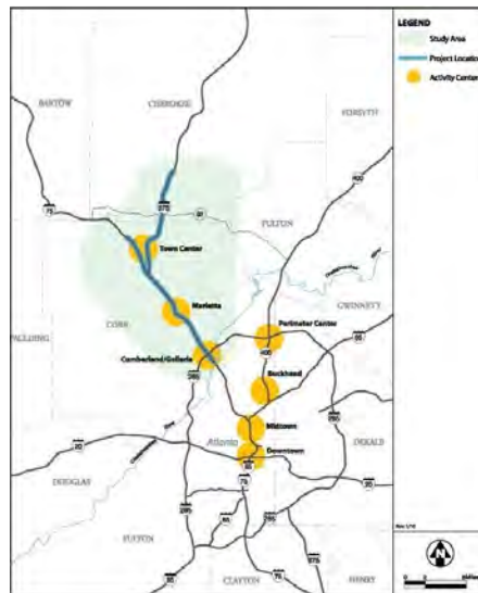
Northwest Corridor Reversible Lanes Project

Two projects designed to keep Georgia moving are moving forward. Contractors have been selected for reversible lanes projects along I-75 in Henry and Clayton counties and the I-75 and I-575 in Cobb and Cherokee counties.