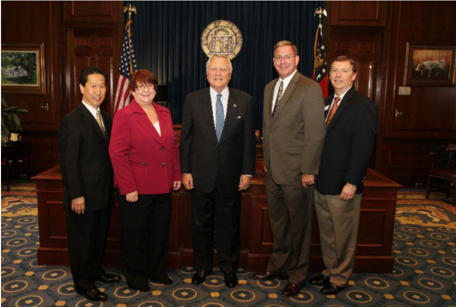
Governor Nathan Deal (center) with Gwinnett County shortly after the SRTA Board approved a grant for transportation improvements at Venture Drive off of I-85.

On Wednesday, May 28, Governor Nathan Deal announced the approval of funding for 20 transportation infrastructure projects totaling $33 million in grants and loans provided through the Georgia Transportation Infrastructure Bank (GTIB). This represents the largest funding cycle for the GTIB program since its inception. The GTIB program is a revolving infrastructure investment fund established in 2008 by Georgia legislators and administered by the State Road and Tollway Authority (SRTA).