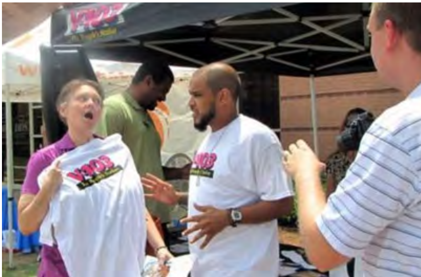
On June 29, V103, The People's Station, helped SRTA get the word out by providing live, on-air coverage of the opening of the Peach Pass Customer Service Center at the Department of Driver Services on Hurricane Shoals Road.

The State Road and Tollway Authority (SRTA) officially opened Peach Pass account registration for motorists who want the option to use the new I-85 Express Lanes when they open later this summer. The Peach Pass, a small, thin toll collection device, will provide access to the new I-85 Express Lanes and the all-electronic toll lanes on GA 400. Peach Pass registration is available online at www.PeachPass.com , by phone at 1-855-PCH-PASS (724-7277) and in-person at two Department of Driver Services locations in Gwinnett County: 2211 Beaver Ruin Road, Norcross and 310 Hurricane Shoals Road, NE, Lawrenceville.